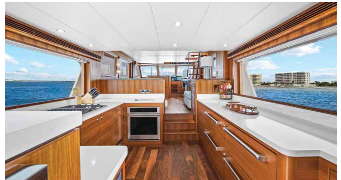
The 670's interior has satin-finish teak, a white vinyl headliner and abundant natural light, all creating a warm vibe.

The pilothouse helm station has an Admiral 500N Stidd helm seat, a custom wood steering wheel, a Hypro Marine hydraulic steering system, a bow-thruster control and quick side-deck access.